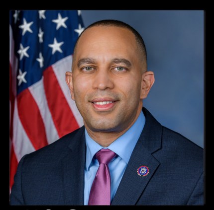
U.S. Congressman Hakeem Jeffries